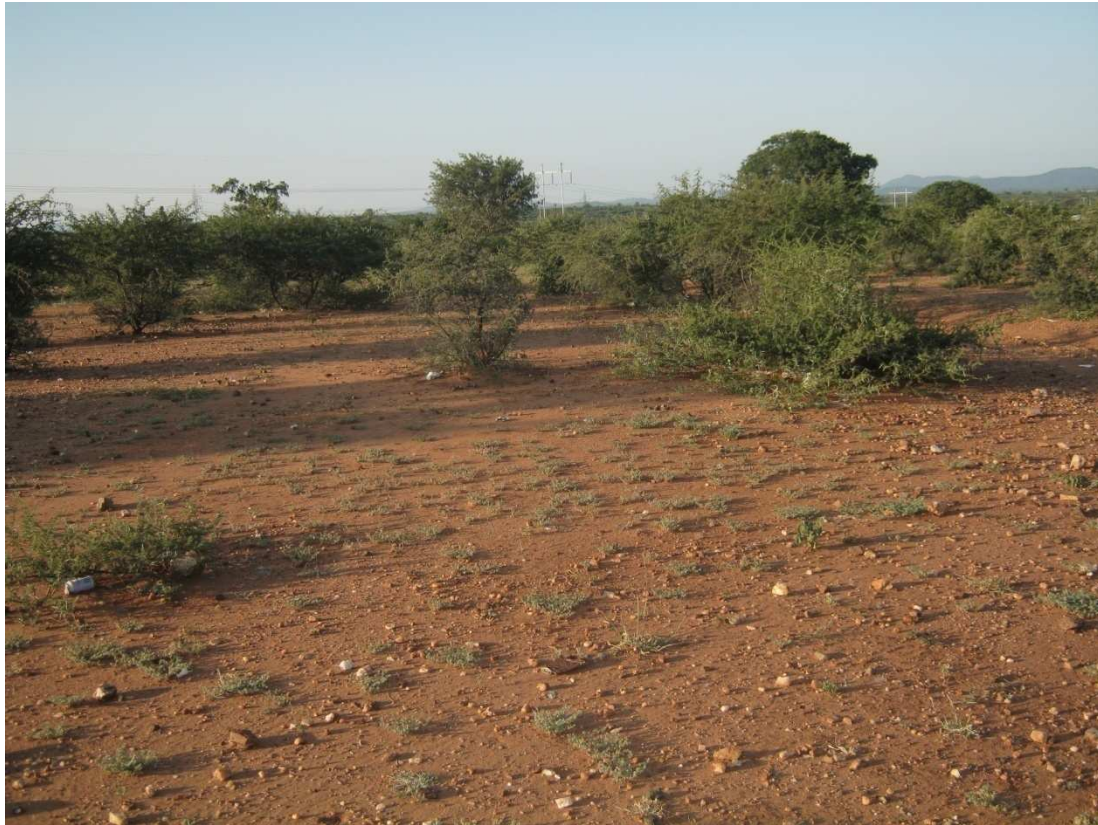
Figure 4: Evidence of loss of biodiversity in ward 22 of Chivi district