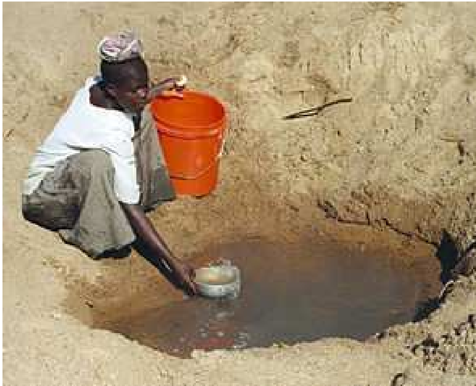
Figure 3:A woman in ward 28 fetching water from an open hole dug in the dry sand of riverbeds in Runde river