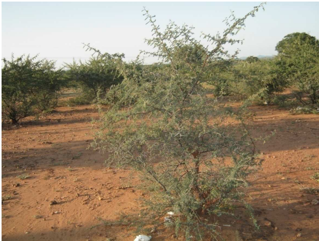
Figure 2: Evidence of loss of biodiversity in Chivi district

Loss of biodiversity is another negative impact of climate change and variability. Dhilwayo (2007) argues that some animals like hippopotamus are no longer common. They have either died or migrated to areas where they can find water or they were killed by people to supplement their diet. (Dhilwayo2007). Trees like baobab which are known to be drought resistant are also deteriorated. The area is developing into no tree zone except only small thorn trees which are not helpful to the survival of people are thriving as illustrated by the picture below.