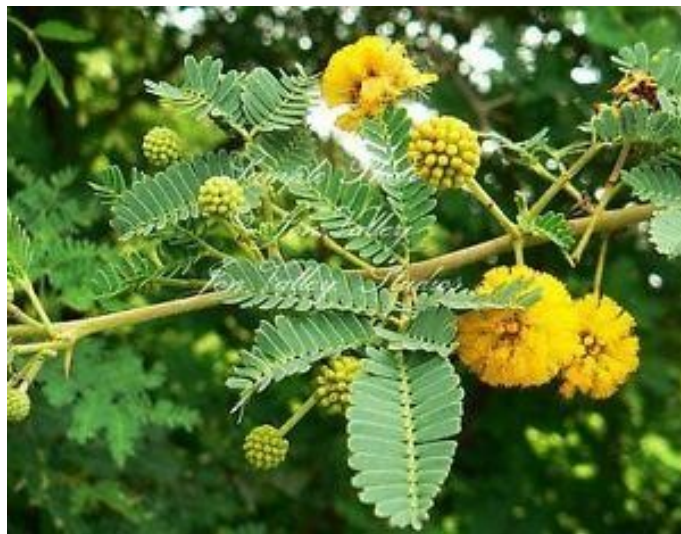
Figure 3: Image of Acacia nilotica (Maywald, 2003).

Acacia nilotica is a small to medium-sized tree with a dark brown to almost black, deeply fissured in older specimens. The thorns are in pairs, straight and they are usually pointing backwards (Maywald, 2003). The leaves of Acacia nilotica are compound with 4-8 pinnae and the flowers are in spherical heads on the new growth and yellow in colour. The pods are distinctive and constricted between the seeds. When Acacia nilotica pods are in their early stages, they usually exhibit a green colour which turns black when ripe. The indehiscent and old pods are often still on the tree when the new pods appear (Maywald, 2003). Acacia nilotica species is similar to Acacia karroo but, it can easily be distinguished by the distinctive pods. When no pods are present, the slightly deflexed thorns and the small, closely spaced leaflets may aid in differentiating them from other Acacia species (Maywald, 2003).