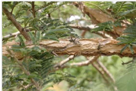
Figure 1: Image of Acacia sieberiana (Venter and Venter, 2002)

Acacia sieberiana often has a flattened canopy when it is medium or large in sized tree. Its bark is grey in colour, rough and it peels to reveal a yellowish layer underneath. Acacia sieberiana are characterised by their thorns which are paired at the nodes, straight and older trees appear thornless which differentiate them with other species (Brown et al. , 2006). The leaves of Acacia sieberiana are compound large with 8-20 pairs of pinnae and the leaflets are pale green or yellowish-green in appearance. The flowers in axillary are spherical heads and creamy-white in colour. The pods of Acacia sieberiana are large, thick and woody. They are usually found in wooded grassland and woodland, on floodplains and along rivers. They are distributed worldwide, and they are widespread in Africa from tropical West Africa to Sudan and Ethiopia and southwards through East Africa to Namibia, Zimbabwe and South Africa (Brown et al. , 2006). The flowers of Acacia sieberiana attract a wide array of insects to the trees and these in turn lure a range of insect-eating birds into the vast canopies. Wood hoopoes and woodpeckers forage in the soft flaky bark whilst certain birds, like pied and crested barbets, utilize the stems for nesting holes (Brown et al. , 2006).