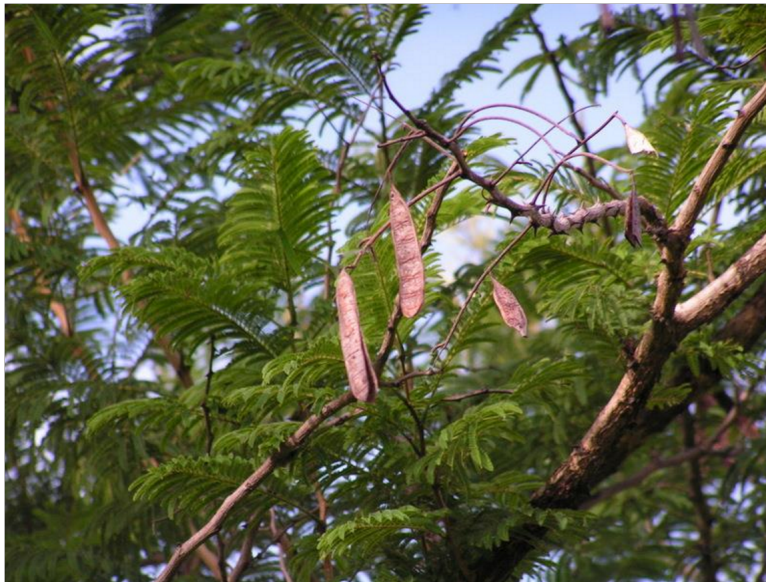
Figure 2: An image of an Acacia polyacantha (Bingham, 2012).

Acacia polyacantha is also known as white thorn. It is a flowering tree which can grow up to 25m tall in height (Norton and Carpenter, 1998). Acacia polyacantha is native to Africa, India, the Indian Ocean and Asia, but it has also been introduced to the Caribbean. They are usually medium-sized to large semi-deciduous tree with a typically layered crown. The bark is pale to dark yellowish-brown in colour and peeling to show whitish inner layers. The thorns of Acacia polyacantha are hooked and often persisting on the larger branches and the trunk. The leaf petioles have an oblong flattened gland near the base and inflorescences axillary are elongated spikes consisting of creamy white flowers (Bingham, 2012).