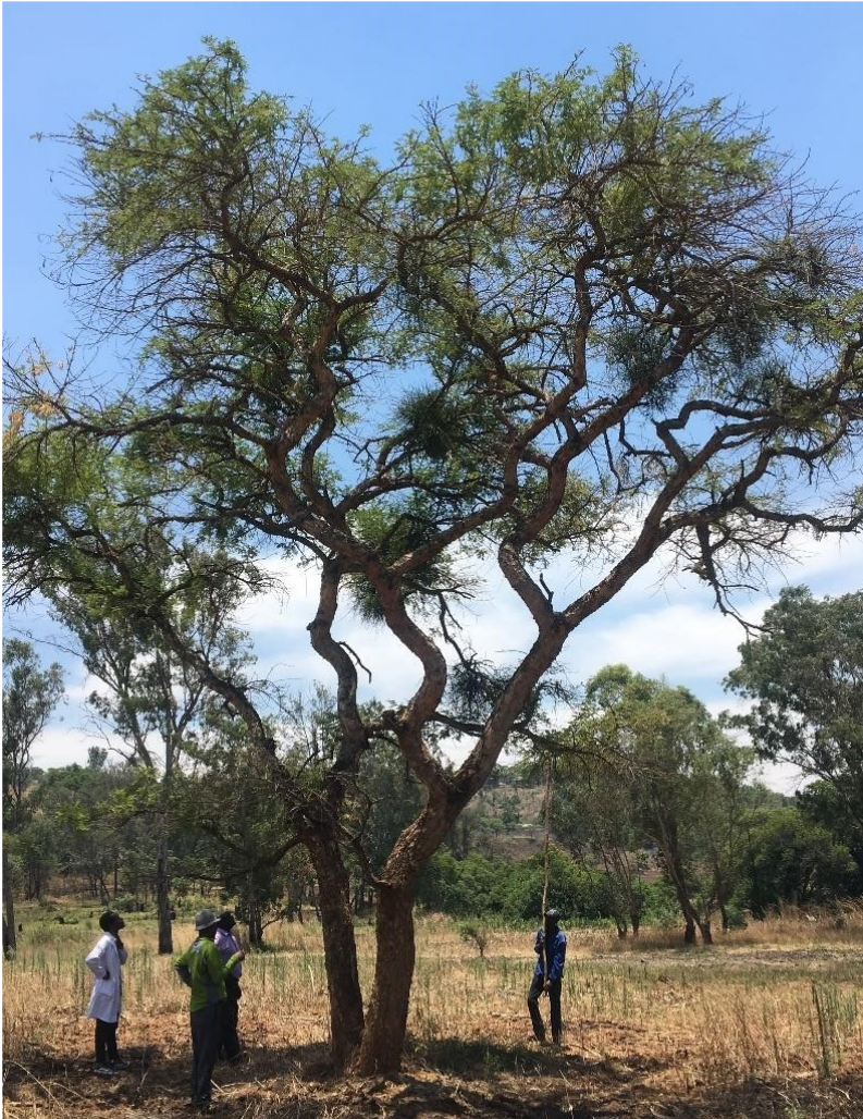
Figure 4: Image of Acacia species infected with Viscum articulatum (Picture was taken at Hakuna Matata Primary School in Greystone Park).